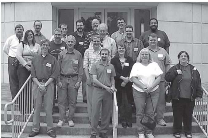
Attendees of the 3rd Annual Georgia Regional Astronomer's Meeting (GRAM) at Berry College in Rome, GA on Saturday, 23 October 2004